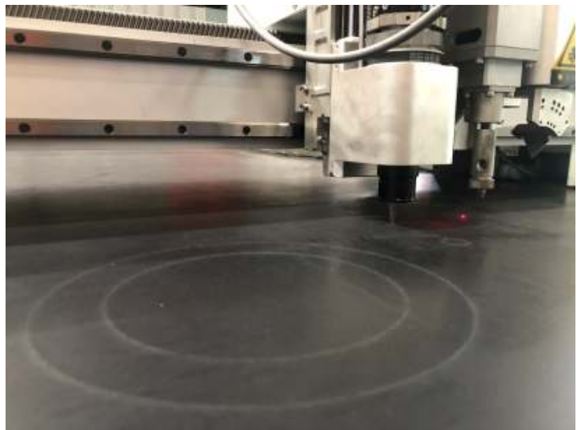
ACCURATE PROFILE CUTTING