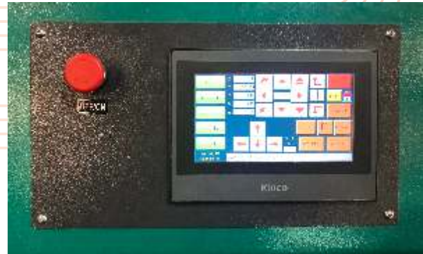
LCD TOUCH INPUT