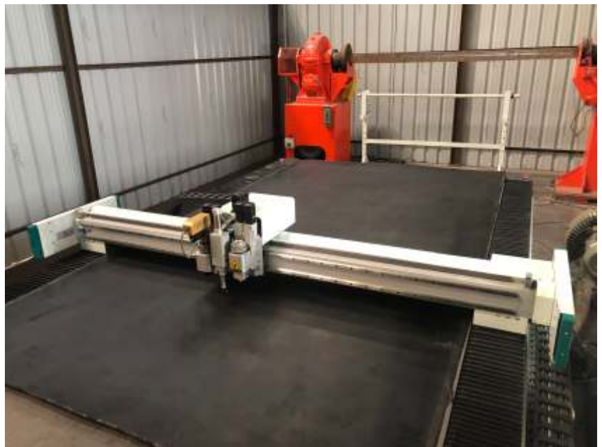
LARGE CUTTING AREA