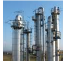
Chemical & Fertilizers