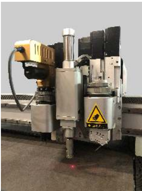
HIGH PRECISION CUTTING HEAD